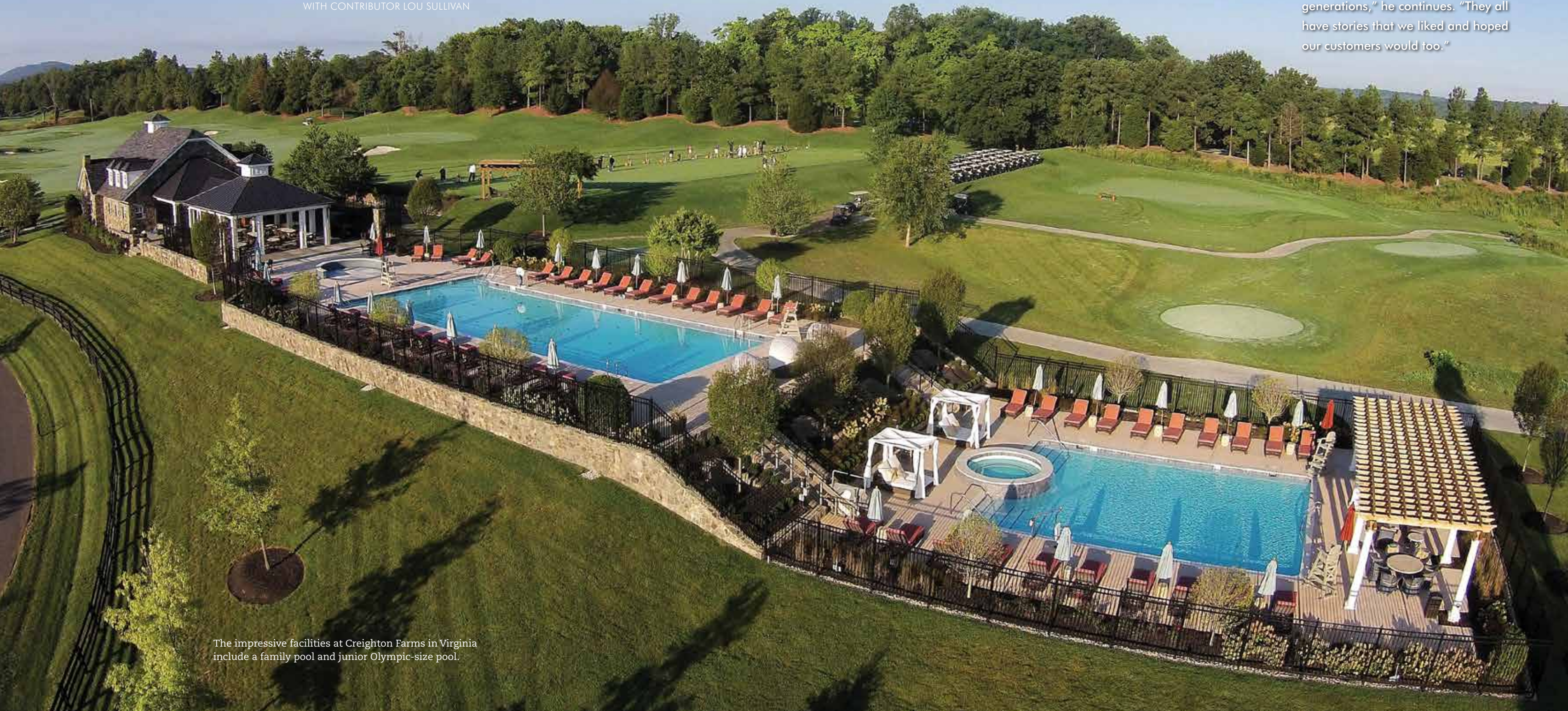
The impressive facilities at Creighton Farms in Virginia include a family pool and junior Olympic-size pool.

years that a course had been built on the west coast of Scotland and the first course built on a Site of Special Scientific Interest. That was a story we could run with. Creighton Farms lies in the shadow of our nation's capital, in the midst of Virginia horse country. Meredith Bay on Lake Winnepesaukee has been a destination for families for generations," he continues. "They all have stories that we liked and hoped our customers would too."