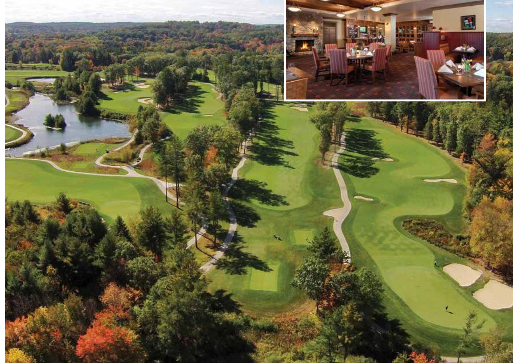
Below: The great Scottish links of the 19th century and landmark American layouts of the 1920s-inspired Renaissance’s golf course design. Right: Inside the clubhouse’s Grille Room.