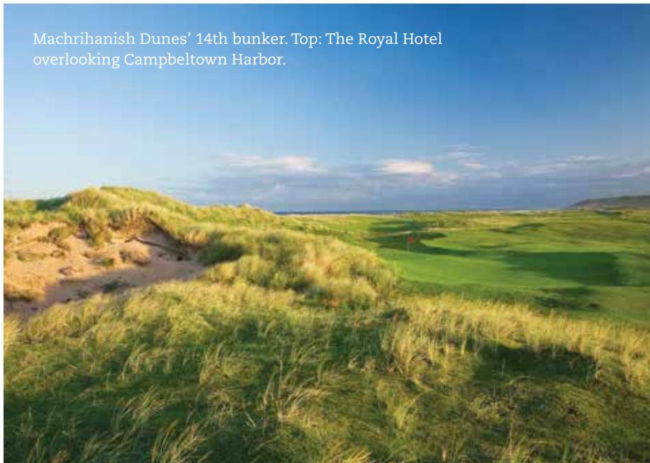
Machrihanish Dunes' 14th bunker. Top: The Royal Hotel overlooking Campbeltown Harbor.

MACHRIHANISH DUNES IN ARGYLL, SCOTLAND , brings players back to the origins of the game while challenging them with its traditional links-style course designed by David McLay Kidd. Ranked 39th among Golf Digest's "Top 100 Courses Outside the U.S.," it is the first ever GEO (Golf Environment Organization)-certified 18-hole course in the United Kingdom. Solidifying the property's status as a premier golf destination, The Village at Machrihanish Dunes tempts with a variety of lodging and dining options, including the Machrihanish Dunes Golf Club, the historic Royal Hotel, Ugadale Hotel & Cottages and The Old Clubhouse Pub & Restaurant.