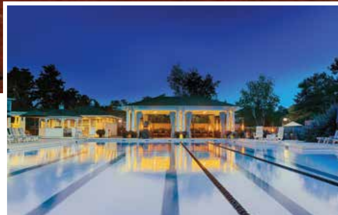
Top: Willowbend’s expansive Clubhouse overlooks the Bog Course’s 18th hole. Right: Pool views from Café Amici.

PERHAPS SOUTHWORTH’S MOST WELL-KNOWN property, and also its first-ever constructed, Willowbend on Cape Cod is a 450-acre private club sited in Mashpee with residences varying from custom homes to townhomes to villas. Amenities include 27 holes of championship golf, stadium-style tennis courts, a restaurant and clubhouse, fitness center and Olympic-size pool. Satisfying both active and relaxed lifestyles, the club’s menu of perks is well-rounded and continually evolving. Its members-first policy resulted in a 2006 debut on Travel & Leisure’s “Top 100 Communities in America” list.