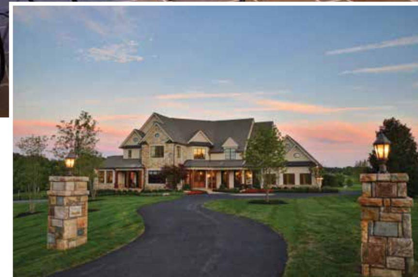
Top: Creighton Farms’ impressive tri-level Clubhouse includes a Grille Room with outdoor terrace. Left: Estate homes are custom built on three-plus acres of land.

A LITTLE FARTHER NORTH , on the shores of Lake Winnepesaukee in Laconia, New Hampshire, Meredith Bay encompasses 430 acres of coveted “vacation land.” Many of the Adirondack-style homes, townhomes and new luxury condominiums afford beautiful views of the lake. The community includes a private marina, beach club, pool, tennis center and hiking trails. As a four-season destination, Meredith Bay rounds out its summertime activities with spectacular fall foliage and a short drive to ski areas in the White Mountains.