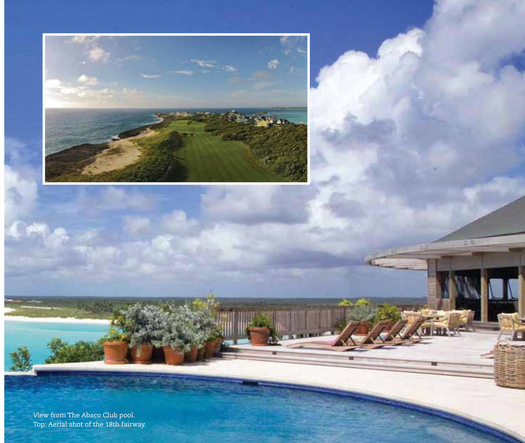
View from The Abaco Club pool. Top: Aerial shot of the 18th fairway.

ROUNDING OUT THE LIST OF LUXURY PROPERTIES is Southworth's most recent acquisition, The Abaco Club on Great Abaco Island in the Bahamas. Custom beachfront home sites, two- and four-bedroom cottages and one-bedroom cabanas promise "barefoot luxury" for the fortunate residents of and visitors to these 534 acres of paradise. With sunrise views over the Atlantic, sunset views