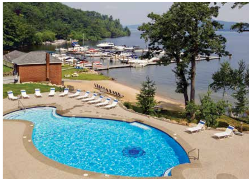
Top: Lake and landscape views from an Adirondack-style home. Left: The Meredith Bay Beach Club and Akwa Marina.

A LITTLE FARTHER NORTH , on the shores of Lake Winnepesaukee in Laconia, New Hampshire, Meredith Bay encompasses 430 acres of coveted “vacation land.” Many of the Adirondack-style homes, townhomes and new luxury condominiums afford beautiful views of the lake. The community includes a private marina, beach club, pool, tennis center and hiking trails. As a four-season destination, Meredith Bay rounds out its summertime activities with spectacular fall foliage and a short drive to ski areas in the White Mountains.